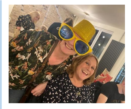
Care Leavers Celebration Event – February 2022