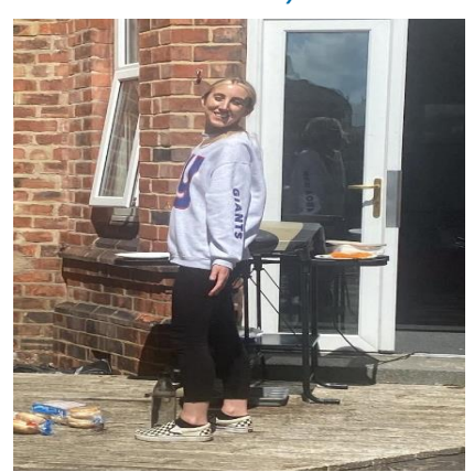
Jubilee Care Leavers BBQ party – June 2022